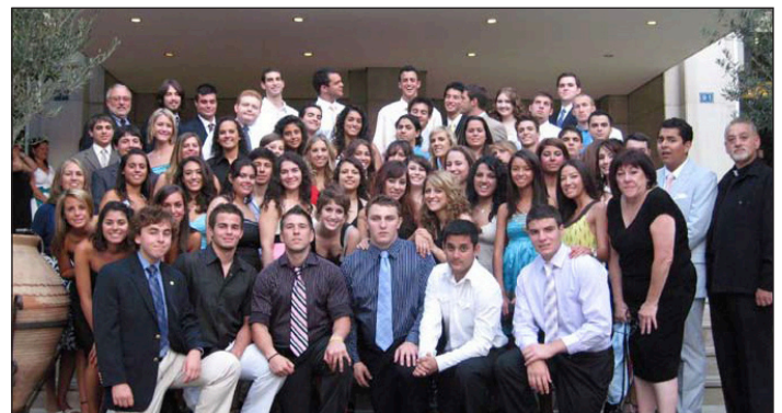
Journey students at the Intercontinental Hotel, Athens for the AHEPA Convention Grand Banquet