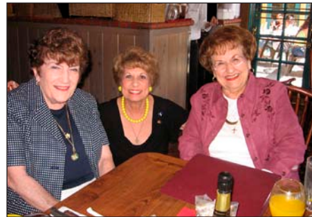
District Convention, Fresno 2008