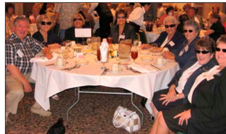
District Convention, Ladies in Black