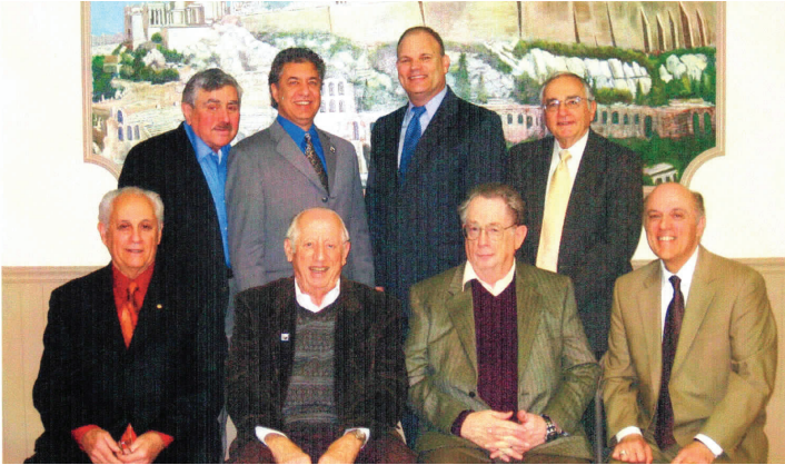
Hellenic Project Committee

Our Chapter entered the new decade with a flourish of activity and events coming off of a successful Hellenic Project event held in the Greek Community of Fresno Social Hall on November 7, 2009. Our efforts have now turned to providing interesting educational speakers preceding our meetings.