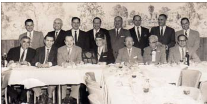
1960 AHEPA Man of the Year and Past Presidents