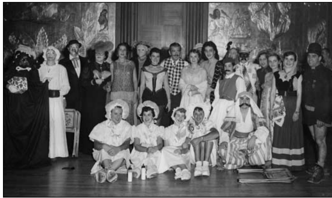
1954 Oakland AHEPA Masquerade Ball