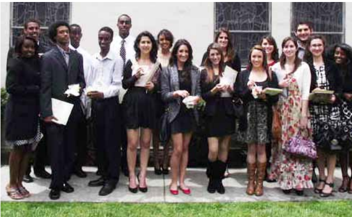
High School Graduates 2011

On this day, for the sixth year, we also honored our youth. We hosted a luncheon for eighteen High School and Church School Graduates, recognizing their scholastic achievement by awarding them a certificate of achievement and a gift of $100.