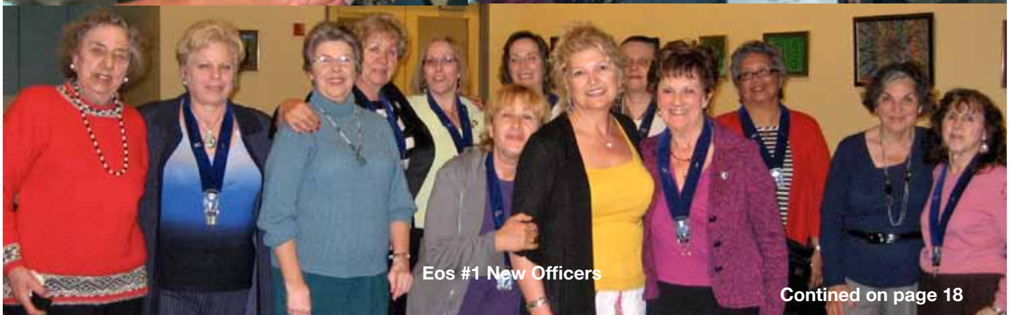
Eos #1 New Officers