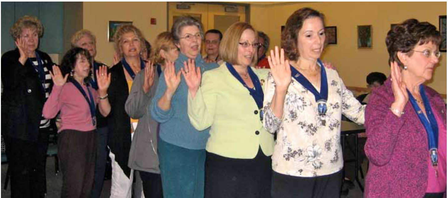
Newly elected EOS #1 officers receiving their oath of office.