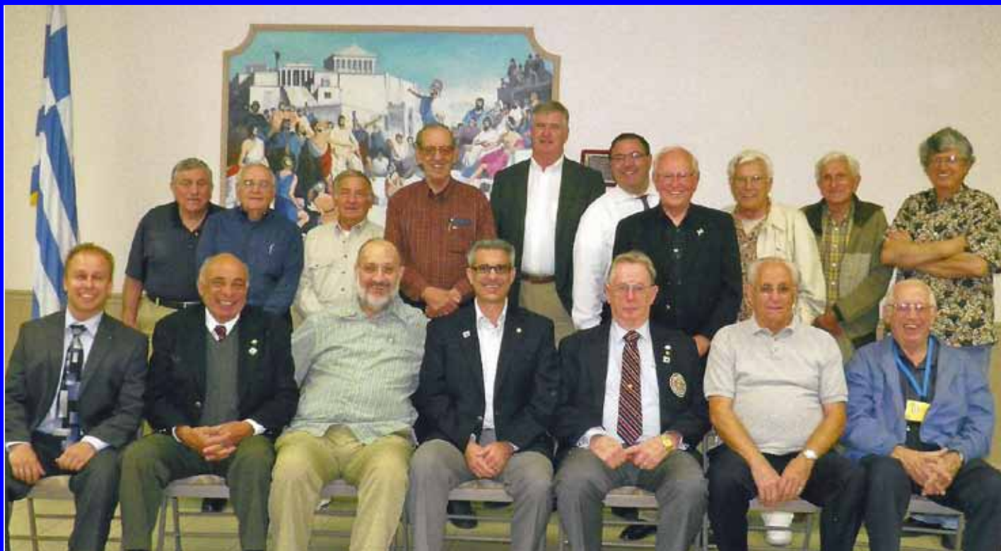
DISTRICT 21 LODGES AT THE FRESNO VISITATION NOVEMBER 3, 2011