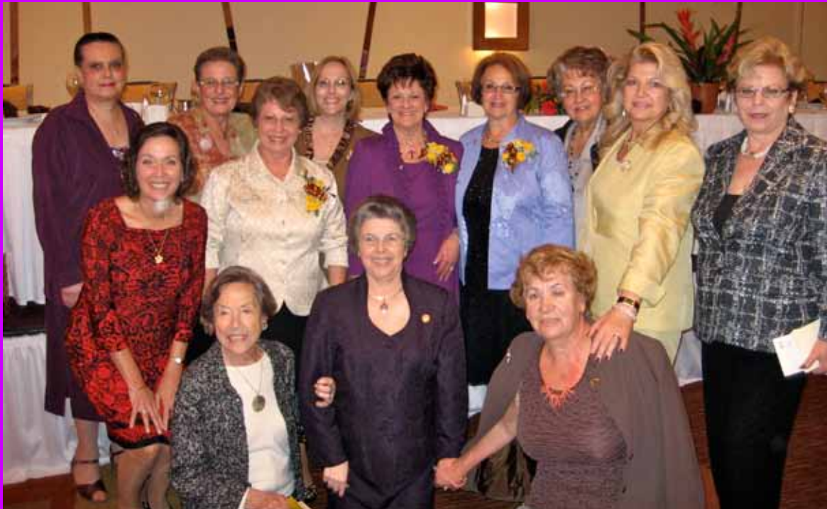
FALL CONFERENCE STOCKTON OCTOBER 8, 2011