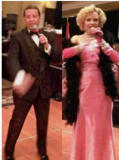
Frank Sinatra and Marilyn Monroe impersonators

Our next event to be hosted in the fall is our District Conference to be held at St. Nicholas Ranch and will be basically a two day event. We hope that all of the members of District #21 make an effort to attend as it will be an exciting weekend!