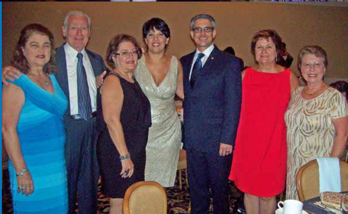
Right: Dressed to kill District #21 members attending Supreme Convention Grand Banquet