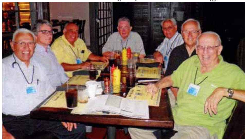
Below: Delegates from District #21 meeting for lunch.