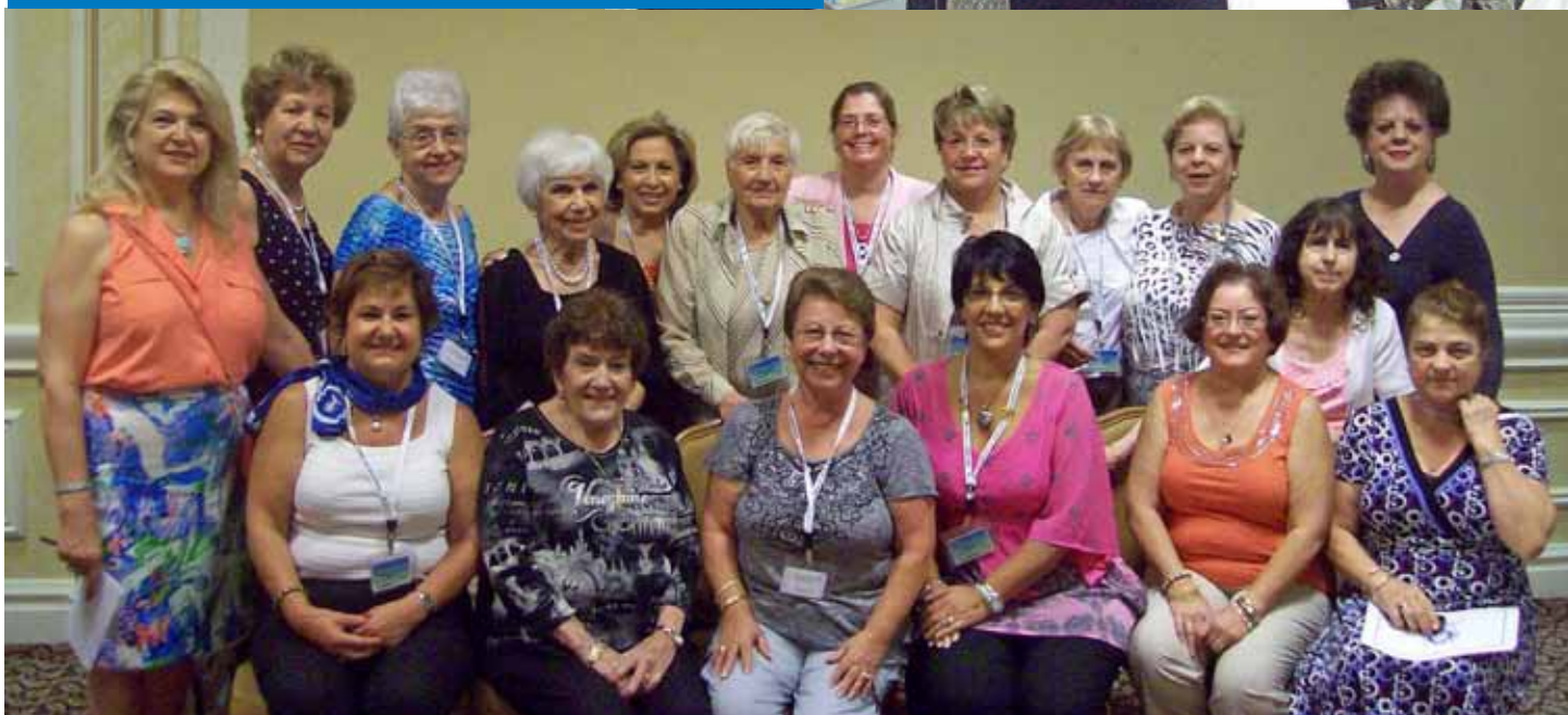
Above: District #21 DOP Delegates, Supreme Convention