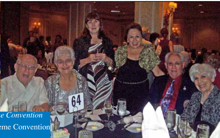
Above: DOP delegates table at the Supreme Convention