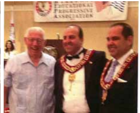
PSC Rockas with SP Grossomanides & SC Lucas