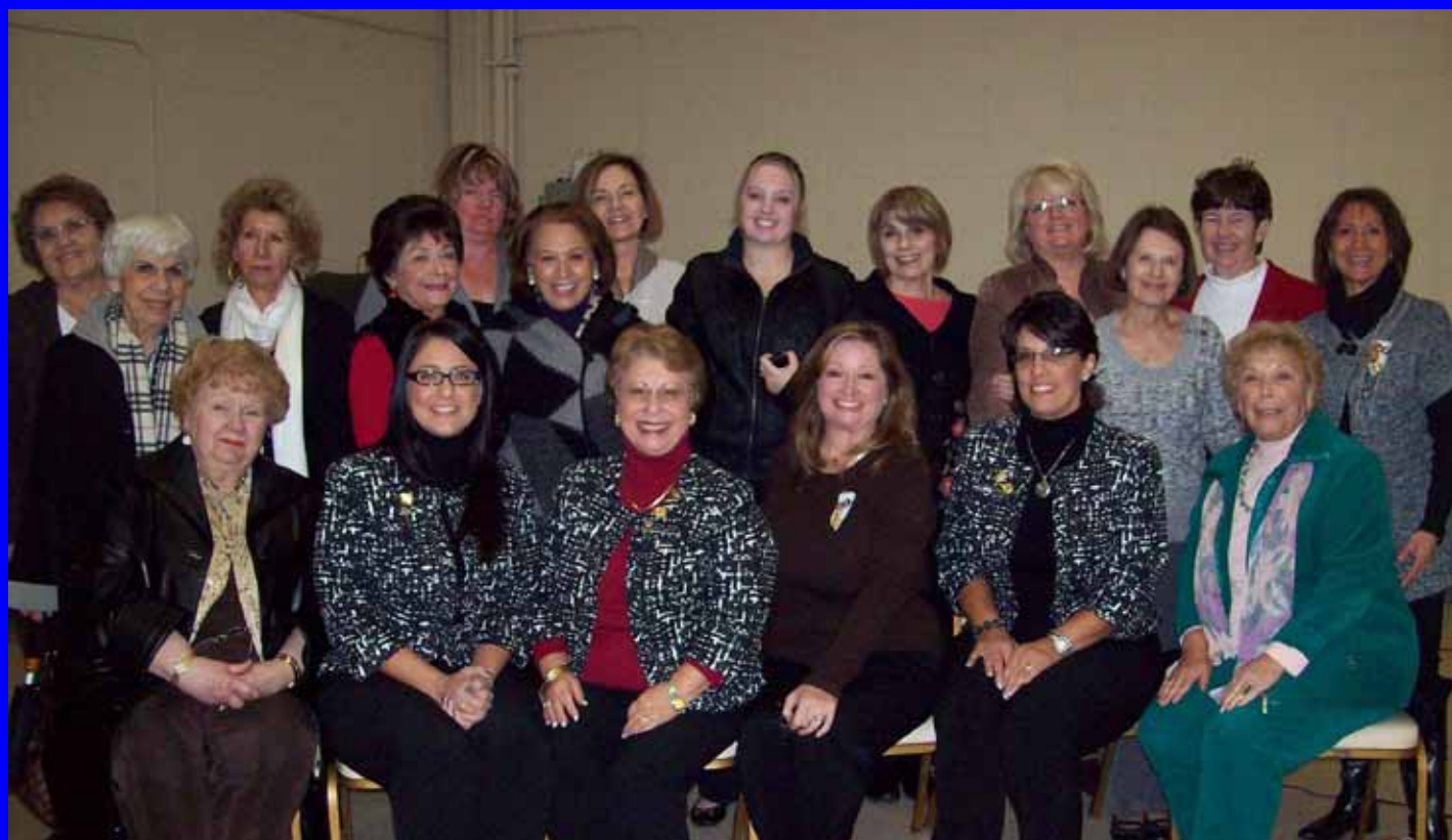
DISTRICT LODGE VISITATION RENO NOVEMBER 5, 2011