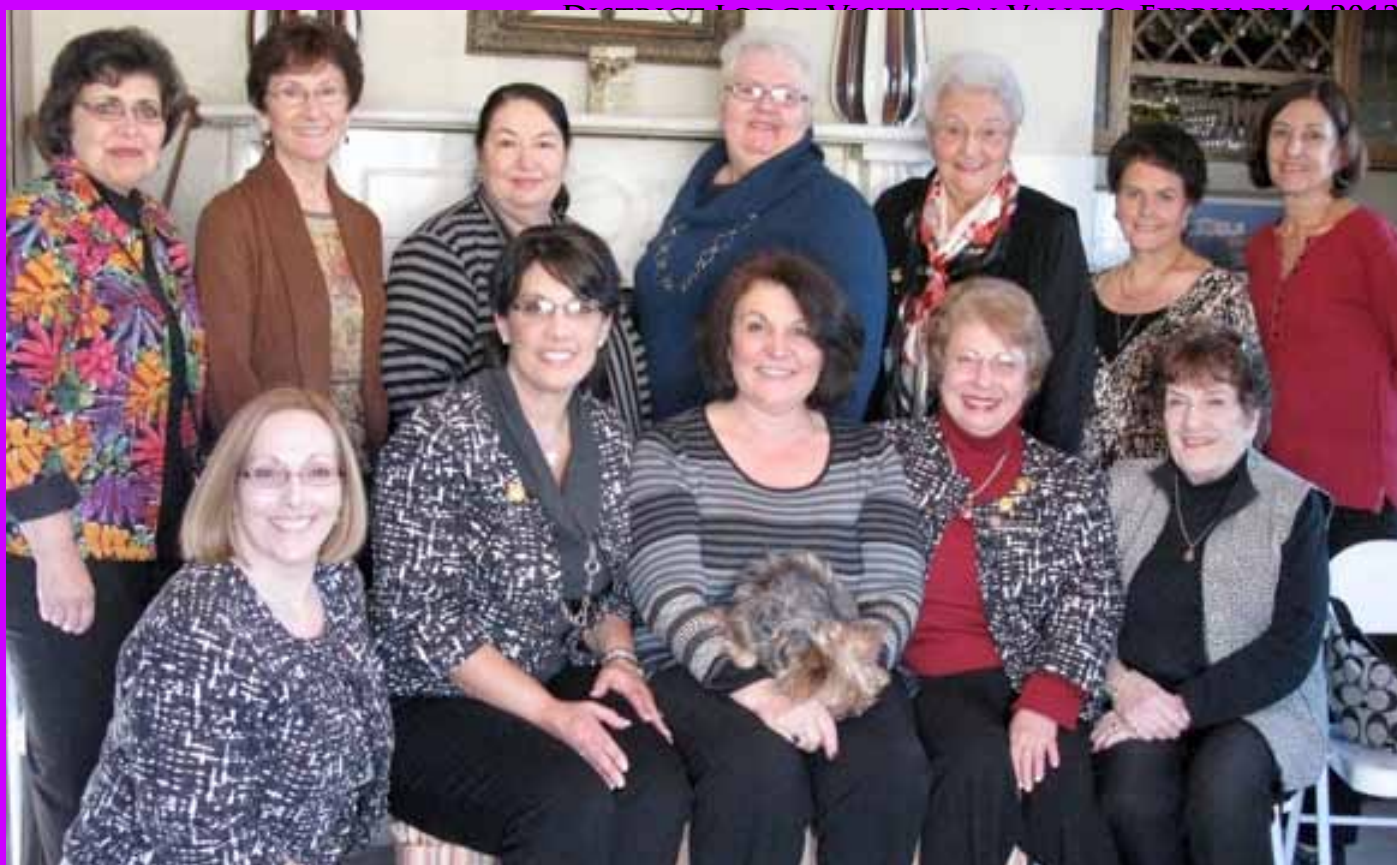
DISTRICT LODGE VISITATION WALNUT CREEK JANUARY 14, 2012