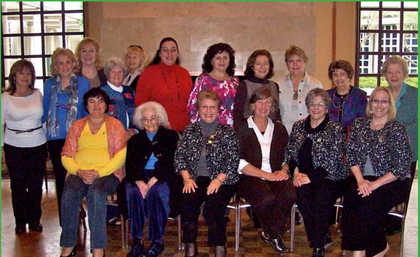
DOP DISTRICT LODGE AND ECHO CHAPTER OAKLAND FEBRUARY 11, 2012