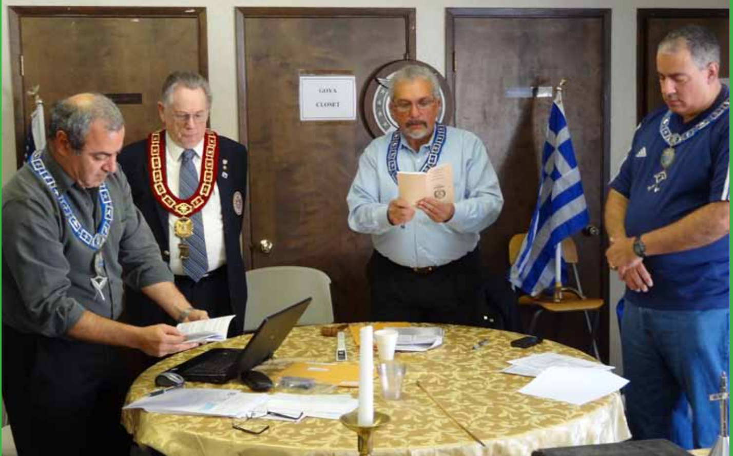
AHEPA DISTRICT LODGE AND SACRAMENTO CHAPTER JANUARY 21, 2011