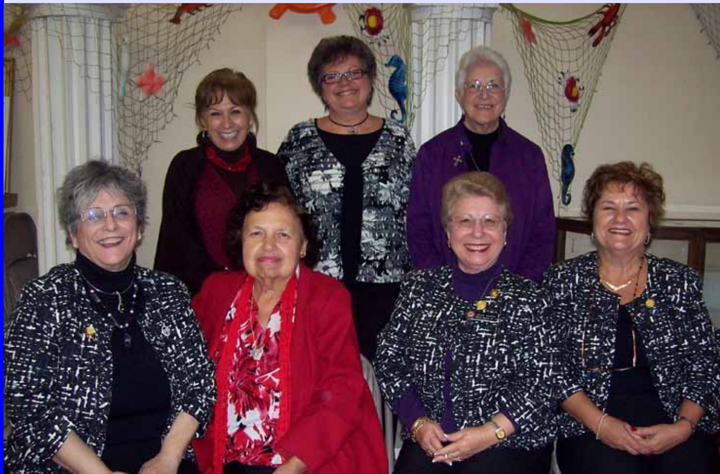
DISTRICT LODGE VISITATION VALLEJO FEBRUARY 4, 2012