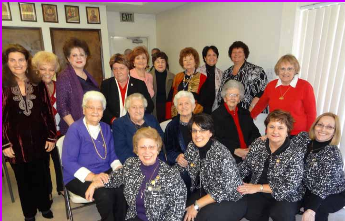
DISTRICT LODGE VISITATION SACRAMENTO JANUARY 21, 2012