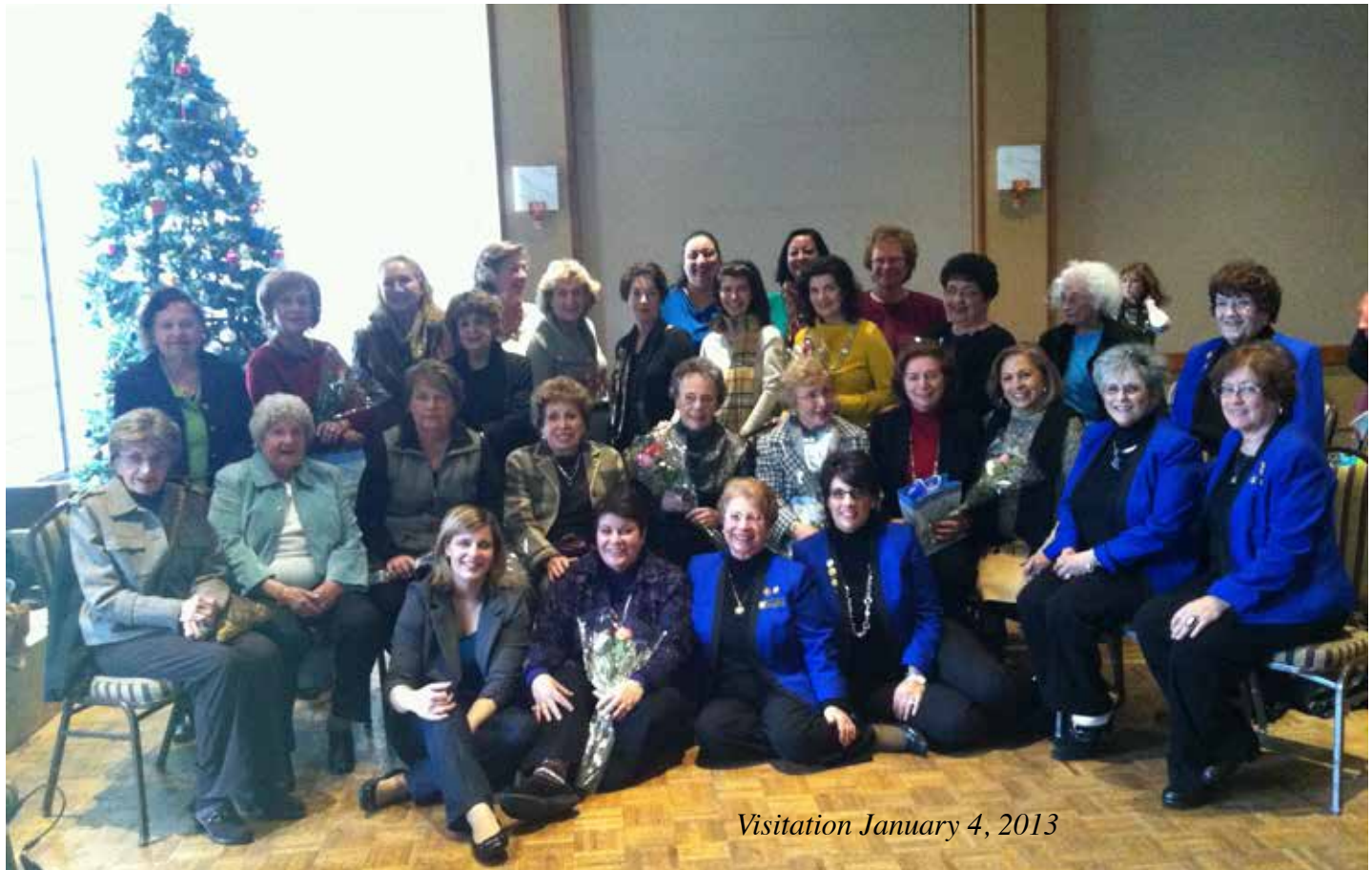
Visitation January 4, 2013

Finally, our chapter looks forward to co-hosting our 2 nd Annual AHEPA Family Barbecue—to which the entire church community is invited—after Sunday church services on June 30 th on the Ascension plaka. Besides enjoying great food together, this fun-raising event provides another opportunity for our church community to know who we are. At this year's event we will celebrate the 80 th anniversary of Echo Chapter #4 and the 85 th anniversary of AHEPA Oakland Chapter #171, and we will be sharing photos and mementos that our members have gathered over the years.