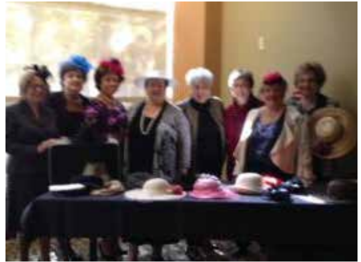
The Hat Parade

Wednesday, December 11, 2013. Dinner and Chapter Awards to be held at the Flames Eatery, San Jose.