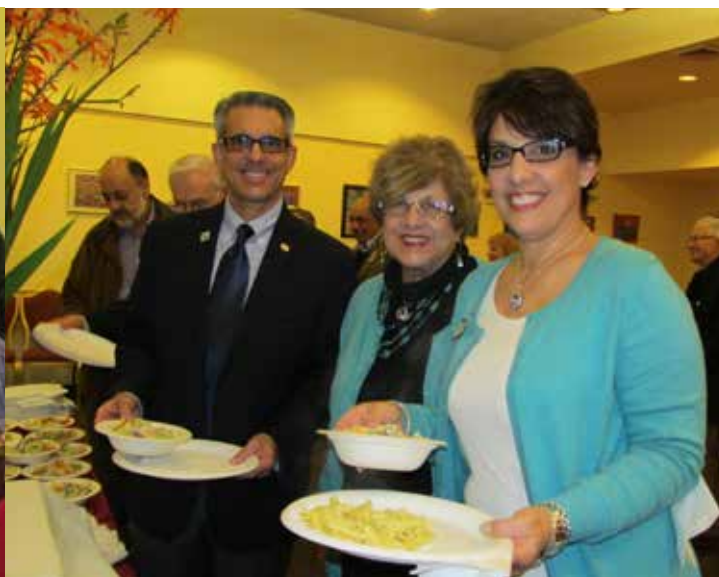
District Officers in Chow Line