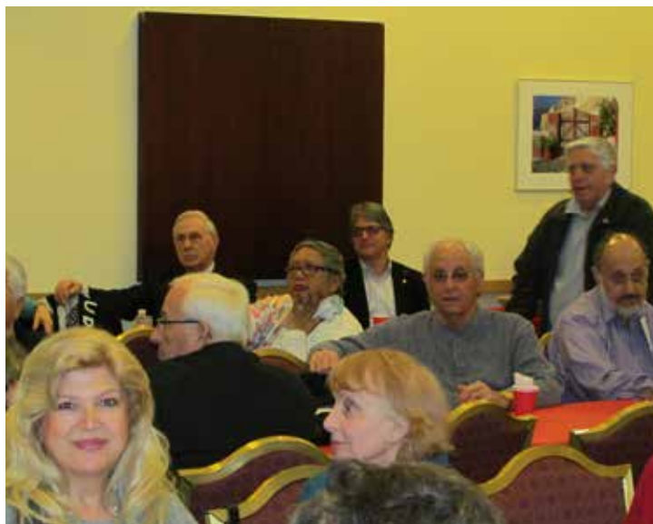
Paying attention to the speaker