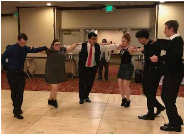
Sons of Pericles and Maids of Athena showing their Greek Dancing skills at the District Convention