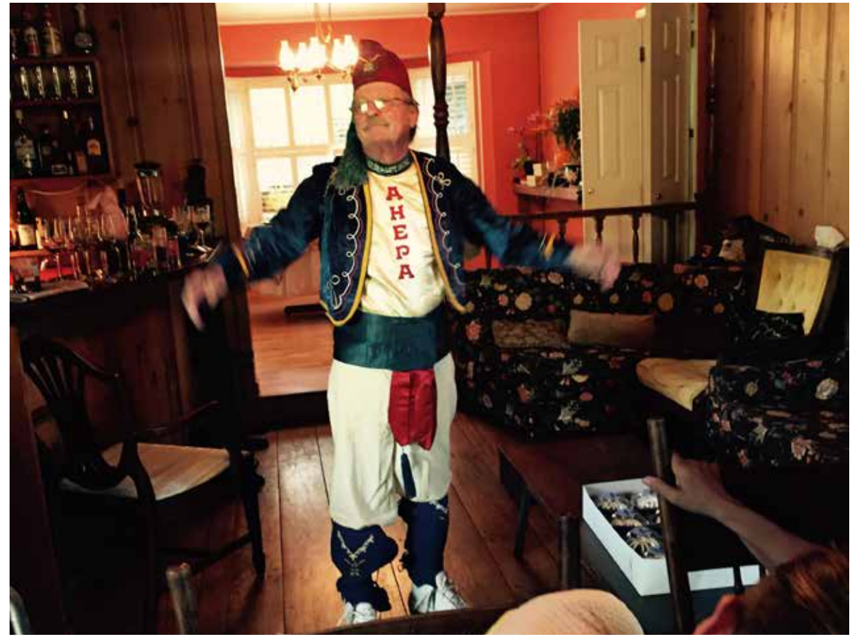
Modeling AHEPA Parade Costume circa 1950-60