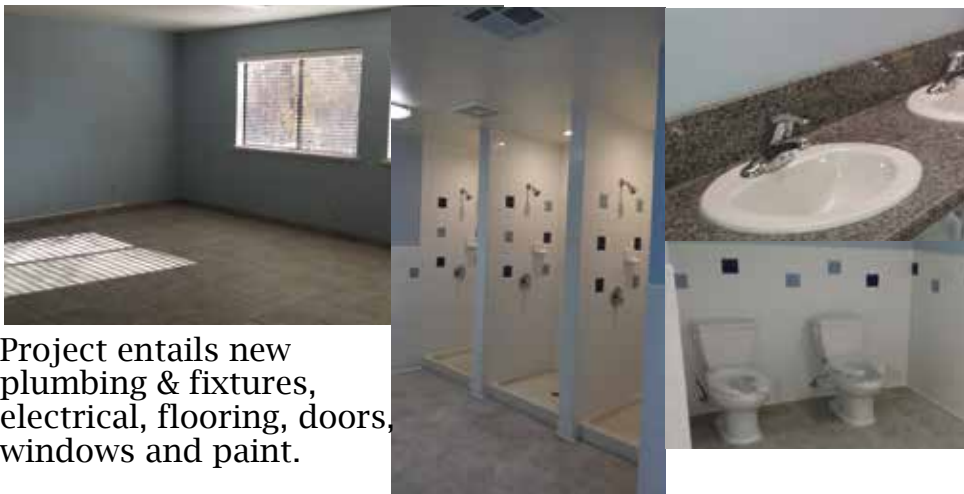
Project entails new plumbing & fixtures, electrical, flooring, doors, windows and paint.

Individual, corporate or group donations welcomed and appreciated.